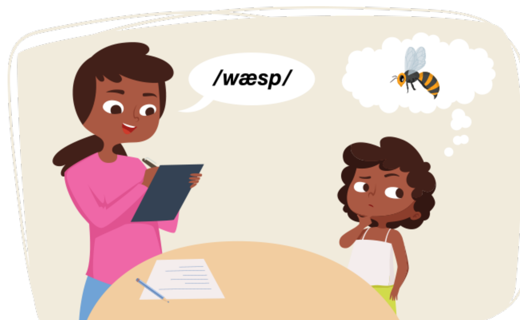
Example of Set for Variability assessment administration